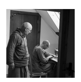
November Sewing session at Cittaviveka, West Sussex, UK