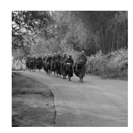
February Morning alms-round, Thailand