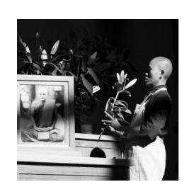
August A sīladhara (nun), Amaravati Monastery