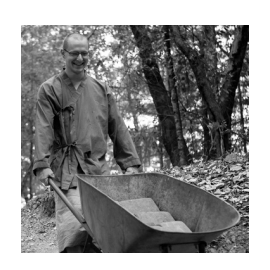
July Abhayagiri, USA