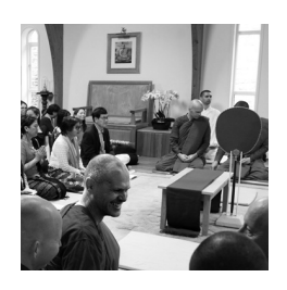
October Robe-offering ceremony, 2017, Aruna Ratanagiri, UK