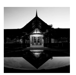
December Amaravati Temple, Hertfordshire, UK