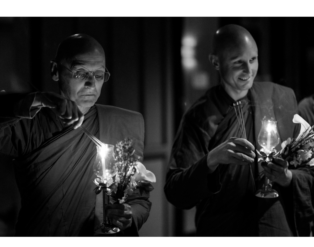
Do not seek the company of misguided friends; beware of degenerate companions. Seek the company of well-guided friends, those who support insight.